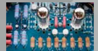
High quality parts

SRM-006tS Specifications ● Frequency response: DC - 80kHz (when used with one SR-L series earspeaker) ● Rated input level: 100mV (at 100V output) ● Gain: 60dB ● Harmonic distortion: 0.01% or less at 100Vr.m.s. / 1kHz output (with one SR-L series) ● Input impedance: 50k \Omega (RCA) / balance input 50k \Omega x 2 (XLR) ● Input terminal: 3/XLR x 1, RCA x 2 ● Maximum output voltage: 300Vr.m.s. / 1kHz ● Standard bias voltage: DC580V ● Mains voltage: local mains voltage (50/60Hz) ● Power consumption: 49W ● Operating temperature / humidity: 0 to 35 degrees C / 90% (non condensing) ● Dimension: (W) 195 x (H) 103 x (D) 380 mm (protruding portion not included) ● Weight: 3.4kg ● Others: input-bypassing parallel output (RCA)