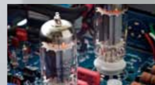
Selected dual triode output tube

Density growth of resolution means widening the frequency range—in other words, the slew rate of sound is improved. This leads to the reexamination of all the response characteristics such as that of active and passive components and circuitry which secures stabilized operation up to ultra-high frequency. Lower distortion and infinitely high-speed characteristic are needed for device itself which at the same time must clear the operating condition. The vacuum tube featuring quick electronic transmission speed has a merit for this purpose. So the dual triode tube 6FQ7 (6CG7) is used at output stage. For the heater power supply, an ultra-high speed rectification circuit is arranged combining low-noise, low-loss shot key barrier diode with large-capacity electrolysis condenser. The signal-to-noise ratio is improved by the low-ripple DC power supply. On the other hand, the balance input at input stage is directly connected to the low-noise FET at first stage using custom-made 2-axis 4-gang volume controller. The proper circuit and strictly selected components bring out rich powerful low frequency and fully transparent sound. Pin arrangement of balance input: 1=shield, 2=hot, 3=cold.