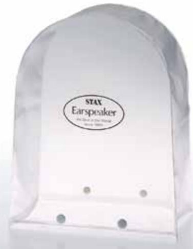
CPC-1 protection sack for earspeaker