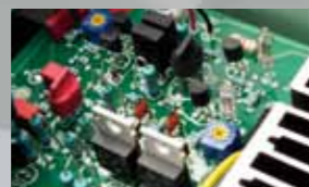
Pure balanced direct-coupled class-A DC circuit