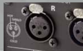
XLR balanced input terminal