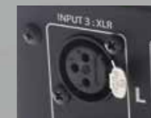
XLR balanced input terminal