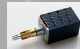
Custom-made 2-axis 4-gang volume controller