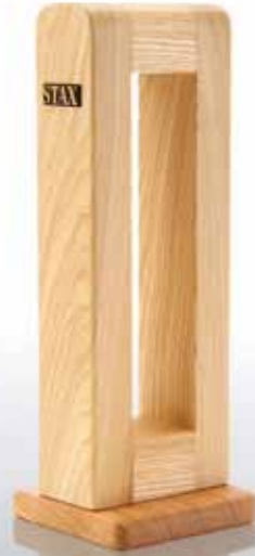
HPS-2 earspeaker stand