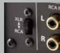
XLR-RCA selector switch

SRM-353X Specifications ● Frequency response: DC - 90kHz (when used with one SR-L series earspeaker) ● Rated input level: 100mV (at 100V output) ● Gain: 60dB ● Harmonic distortion: 0.01% or less (with one SR-L500 at 100Vr.m.s. / 1kHz output) ● Input impedance: 50k \Omega (RCA) / 50k \Omega x 2 (XLR) ● Input terminal: RCA x 1 or XLR x 1 (alternative) ● Maximum output voltage: 400Vr.m.s. / 1kHz ● Standard bias voltage: DC580V ● Mains voltage: local mains voltage (50/60Hz) ● Power consumption: 30W ● Operating temperature / humidity: 0 to 35 degrees C / less than 90% (non condensing) ● Dimension: 150 (W) x 100 (H) x 360 (D) mm (protruding portion included) ● Weight: 3.0kg ● Others: input-bypassing parallel output (RCA)