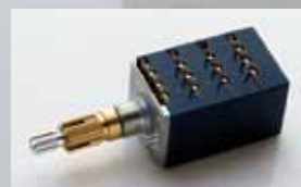
Custom-made 2-axis 4-gang volume controller

The SRM-353X was developed in order to drive the new electrostatic earspeaker of STAX more ideally. High-quality components of audio grade with little aging degradation are selected carefully to improve the purity of fundamental tone quality, and the circuit was reexamined in detail to achieve much more wider frequency range. Accurate solid-state throughput achieves high-speed and high-resolution sharp sound. The XLR or RCA selectable terminal makes it possible to connect to the output of precedent equipments with balance output through the custom-made 2-axis 4-gang volume controller. Furthermore, original low noise dual FET is adopted for the first stage as well as all-stage direct-coupled class-A DC amplifier configuration with no coupling capacitor. The emitter follower circuit at output stage has been brushed up for more higher resolution and significant expansion of the dynamic range especially at high frequency. The chassis made of extravagant non-magnetic aluminum alloy steadily supports highly transparent tone quality.